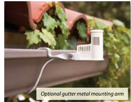
Optional gutter metal mounting arm