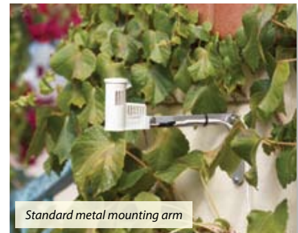
Standard metal mounting arm

Whether you offer a rain sensing device as an upgrade to your installations or you already install one as a standard piece of equipment, wouldn't you like to have options on where you must install it? The usual place to install a rain-sensing device has been on a flat vertical surface, such as a wall or fence. With the Hunter Rain-Click, you can also mount it on a rain gutter (order P/N SGM).